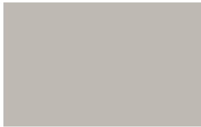
161 Mist Gray